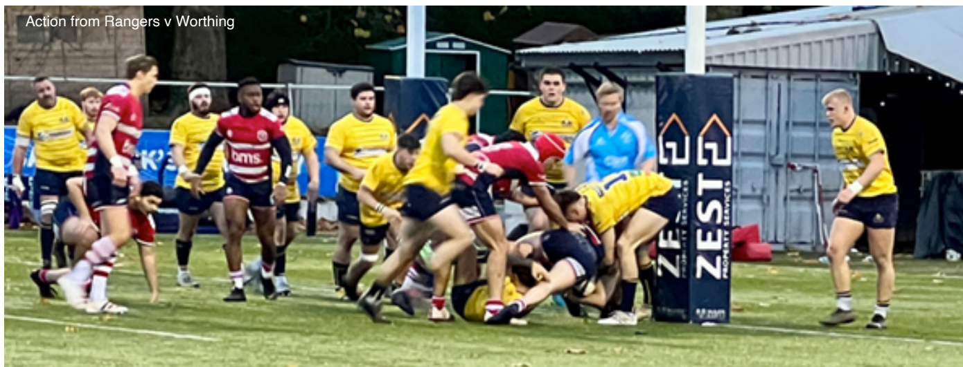
Action from Rangers v Worthing