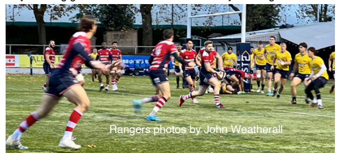
Rangers