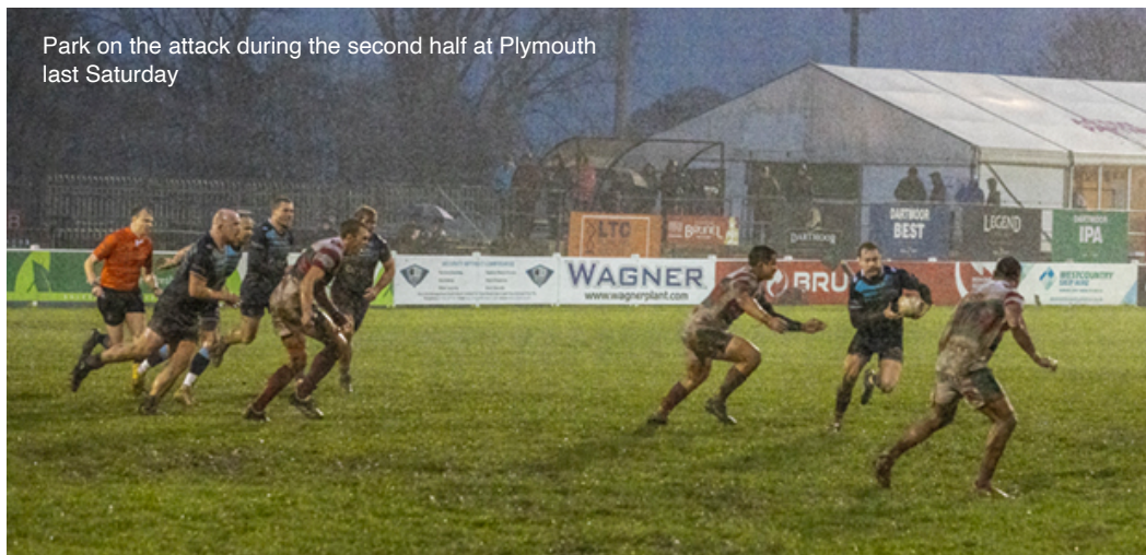
Park on the attack during the second half at Plymouth last Saturday

Welcome to Parknews It was really disappointing to lose last Saturday, but there was a degree of mitigation in that the conditions in which the game at Plymouth was played were really diabolical: it had been raining since the day before and a strong wind was blowing slanting rain along the sodden pitch. It looked to be a choice not of what length stud to use, but whether to wear boots or flippers. It's all very well to quote that old canard that it's the same for both sides, but while Albion took to the conditions like – almost literally! – ducks to water, Park really didn't seem to quite have the game to suit the circumstances, hard as they tried. We made too many errors, but before being too critical you needed to see what the players were striving to cope with. We did have every chance of winning in the second half but just could not force the issue against a side, reduced to 14 men, who were fired up and giving everything and more with fervent support roaring them on. It is a big let down – not least to the players - to lose further ground on the leaders. It was a match we could and should have won, and we really did make far too many errors but you could not fault the effort the team put in after a long coach trip. All we can really do is regather and make a welcome return to the 4G this weekend when we take on Taunton Titans. We're not even half way through the season yet.