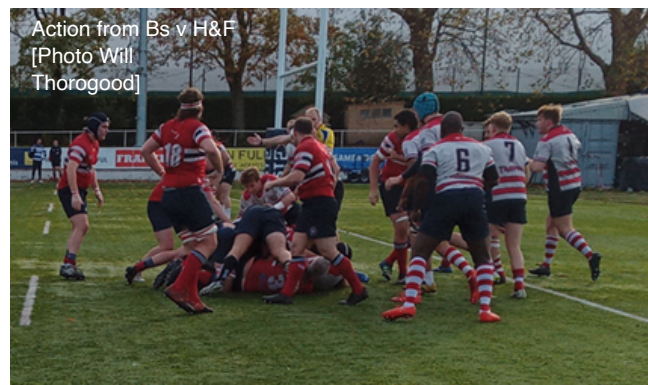
Action from Bs v H&F

If a team starts a game without a recognised front row, they either have to play the whole game with 14 players, or with a 14 points starting deficit, but with 15 players. We chose the latter, so that players weren't denied a game, and there was a more even parity