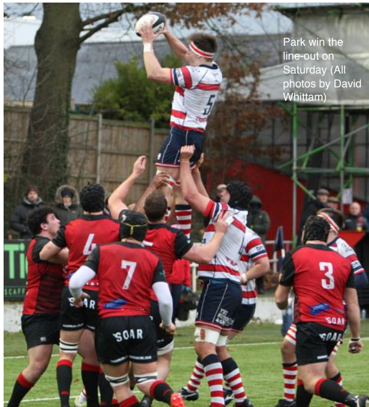
Park win the line-out on Saturday

The home side were now looking good. Atkins slotted over a long-range penalty on 29 minutes for 10-5, then repeated the trick two minutes later for 13-5.